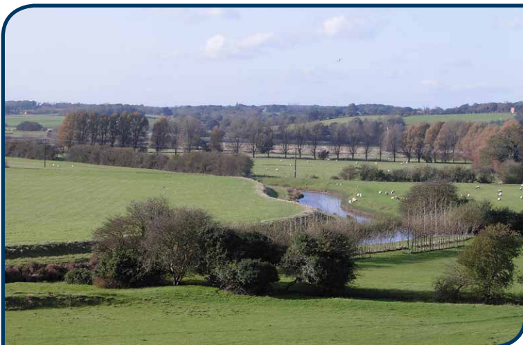
View across the Tillingham Valley