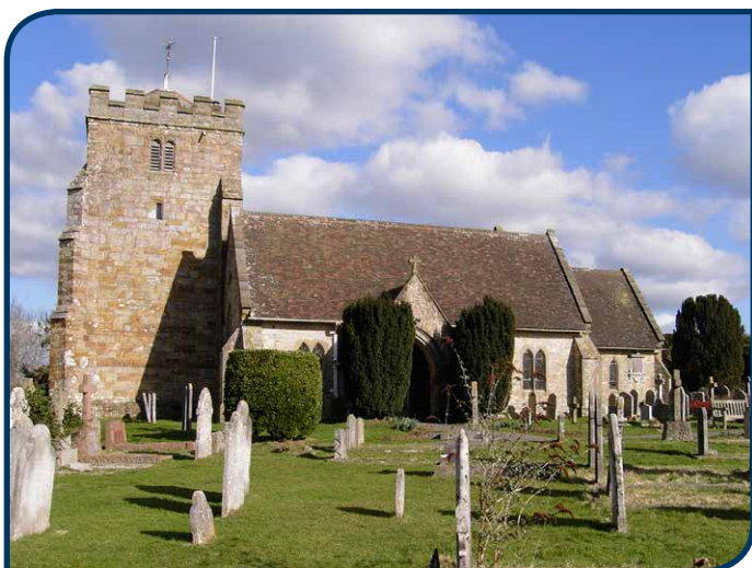
East Hoathly Church