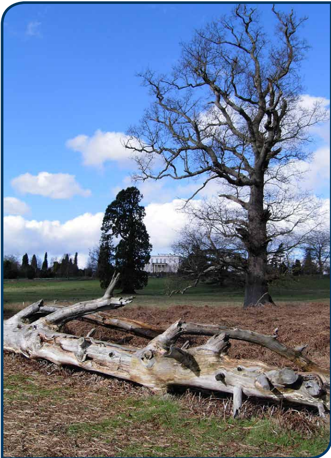
View towards Buxted Park Hotel