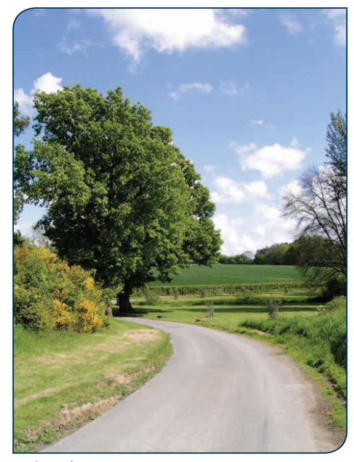
A View along Pump Lane