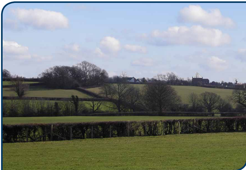
A view from the walk